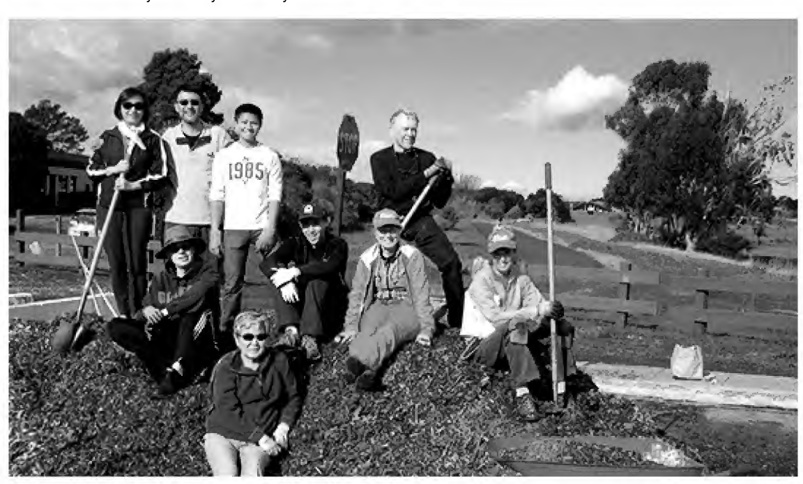
Point Isabel volunteers rest on the mulch.